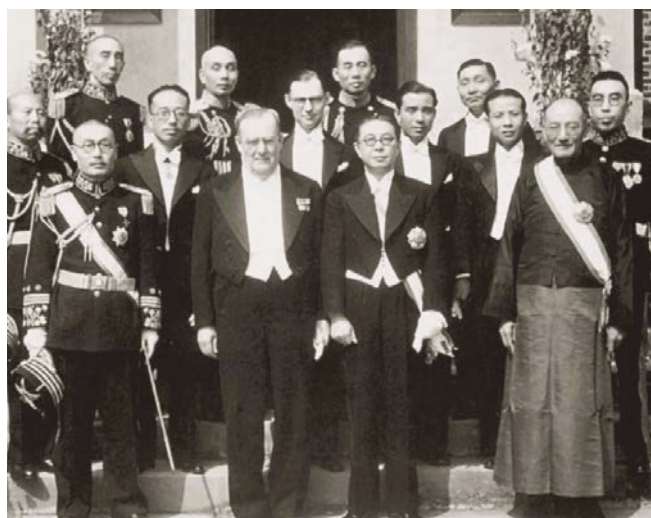
Figure 1. Australian Minister Eggleston poses with Chinese officials after presenting his credentials at Chongqing, source: Chongqing China Three Gorges Museum.

China and Australia should have long ago entered into diplomatic relations, and in view of the present situation in the Pacific, it is imperative for the two countries to exchange diplomatic missions. It is confidently believed that henceforth the friendly relations between China and Australia will be greatly strengthened. 1