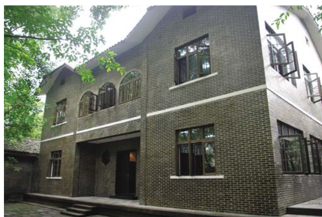
Figures 3 and 4. The compound gate and main building of the former Australian legation at Goose Ridge Hill, Chongqing, 2011, source: Vincent Chang.

The process of restoring wartime heritage in China began in the 1980s, when Beijing's shift away from hard-line socialist ideology created space for local society to revisit its pre-Maoist past. In Chongqing, the ensuing 'new remembering' gave rise to the restoration of former embassies and (spurred by exchanges with Taiwanese officials and scholars) major former Nationalist sites such as Chiang Kai-shek's wartime headquarters. The exhibition there today praises Chiang as an important historical figure, while acknowledging the importance to China's war effort of the 'international anti-fascist alliance'. 10 Pictures of foreign diplomats – including Eggleston – posing with Chiang's officials, are displayed in exhibitions across the city. 11 There is even a local state museum dedicated to the memory of US General Joseph Stilwell, supreme commander of the South East Asia Allied command, which commemorates China's 'friends from the US and other anti-Fascist allies'. In the museum of the Revolutionary Martyrs – a local 'Red' heritage site once known as the 'Exhibition Hall of Crimes by US Imperialism and Chiang Kai-shek' – there are references to the 'worldwide anti-fascist united front' that defeated Japanese imperial aggression. Foreign consulates domiciled in the sprawling metropolis and in nearby Chengdu have contributed to the revival of this episode of Allied history through commemorative books, articles and films. 12