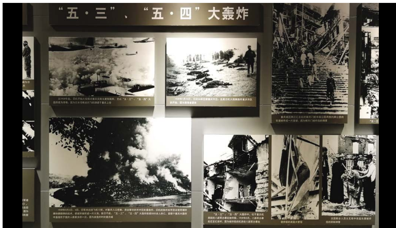
Figure 5. Panel of historic photographs exhibited at the Chongqing China Three Gorges Museum, depicting Chongqing as the ‘City of Perseverance,’ 2018, photo: Vincent Chang.

Recent academic research on historical memory and war remembrance in China has shown how the city–province of Chongqing has succeeded in carving out a unique space within the constantly evolving domestic ‘memoryscape’. 13 Having re-emerged from obscurity during the Mao era, initially as a ‘Red’ revolutionary site, Chongqing has subsequently refashioned itself as the historical centre stage of wartime cooperation between Chiang’s Nationalist government and Mao’s Communist Party, and hence as a rallying site of national unity and strength in the face of foreign aggression. Today, the war exhibition at the Chongqing China Three Gorges Museum – the municipality’s main museum, which welcomes two million visitors annually – depicts Chongqing as the nation’s undefeated ‘City of Perseverance’ and, ultimately, its ‘City of Victory’. This triumphant new reading represents a far cry from the narratives of national humiliation and victimhood often associated with Chinese war memory, and still widely displayed in museums in the regions once occupied by the Japanese (such as Nanjing). Chongqing’s message of heroism, resolve and indomitability aligns neatly with the self-confident, assertive, and more forward-looking central line of war commemoration in Xi Jinping’s China. 14