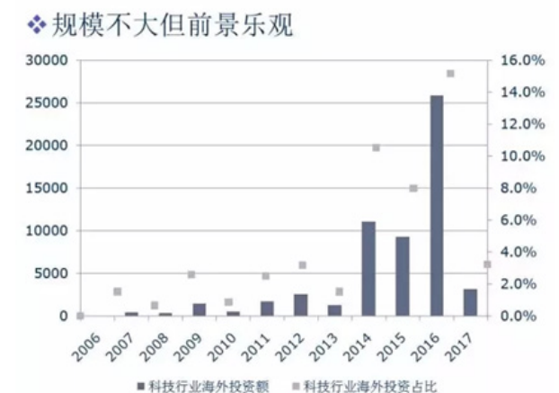
Figure 1: Chinese overseas investments in technology related assets.

Assessing China's Influence in Europe through Investments in Technolgy and Infrastructure